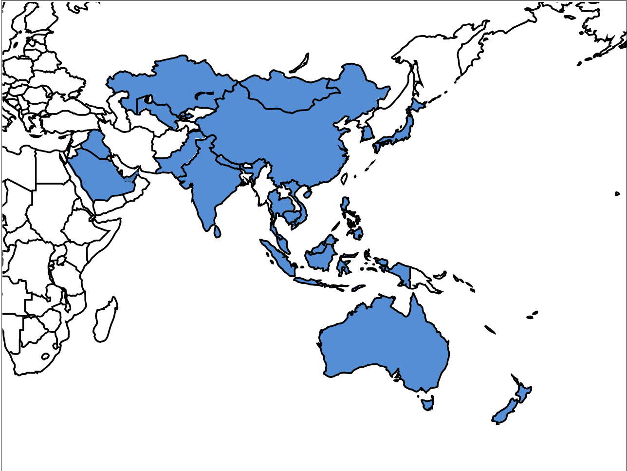
Map 1: Jurisdictions of the AOSSG members

Jurisdictions of the AOSSG members cover a large part of the Asia-Oceania region and are highlighted in blue in the map below.